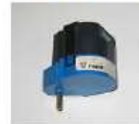
H.225.27.1 Motor f. waxing