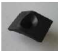
H.205.73.1 End piece f. yarn guide tube