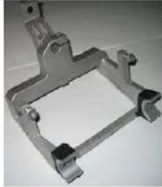
H.220.69.5 Holder f. rotorbearing