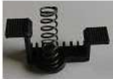
H.205.38.1 Holder f. feed plate