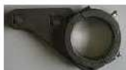
H.210.19.1 Bearing f. delivery shaft