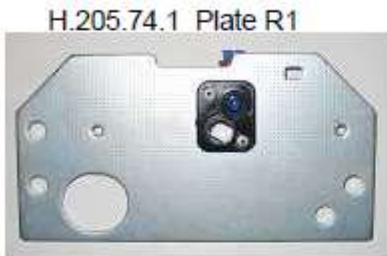
H.205.74.1 Plate R1