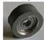
H.1300.89.1 Top roller cpl. with bearing