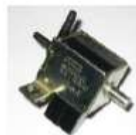
H.200.13.9 Direction control valve 3/2