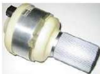
H.210.06.5 Clutch f. delivery shaft cpl.