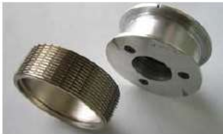
H.2000.28.5 Opening roller SOLID RING OS21-6 cpl.