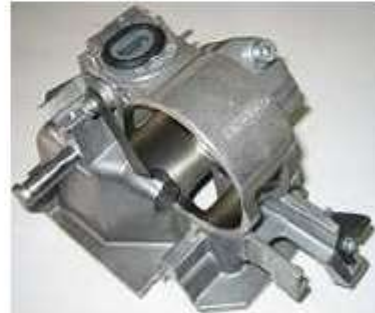
H.205.20.2 Opening roller house R20