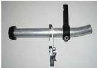
H.240.10.1 Tube FUS