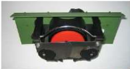
H.225.13.1 Waxing device cpl.