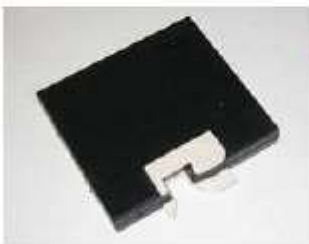
H.225.31.1 Yam monitor