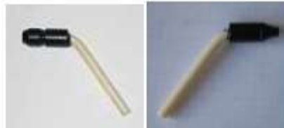
H.205.42.4 Yarn guide tube R1