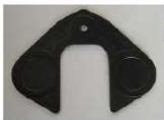
H.230.09.1 Air flap