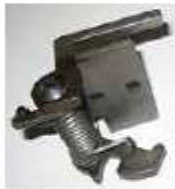
H.205.01.1 Handle f. cover