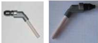
H.205.42.1 Yarn guide tube soft twist R1