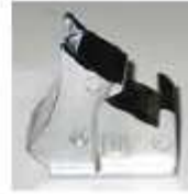
H.205.37.2 Feed plate R20