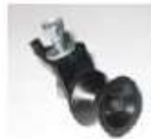
H.1300.42.4 Roller bearing