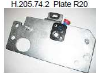
H.205.74.2 Plate R20