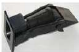
H.205.63.1 Suction FUS cpl. R1