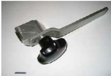
H.2000.28.9 Tool f. opening roller house clip