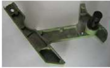
H.205.84.4 Lever f. rotorcleaning R1