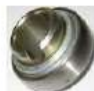
H.210.19.2 Bearing GLE 25