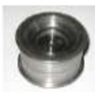
H.2300.7.1 Tension roller