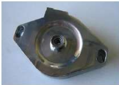
H.205.39.30 Face plate D30 mm R1