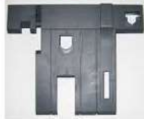
H.205.19.1 Coverage R1