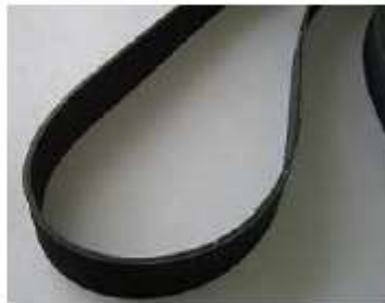
H.220.53.1 Flat belt 20x53.550 10S H.220.53.2 Flat belt 20x58.450 11S H.220.53.3 Flat belt 20x63.350 12S H.220.53.4 Flat belt 20x68.230 13S H.220.53.5 Flat belt 20x73.125 14S