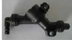
H.205.72.2 Valve f. rotorcleaning R1