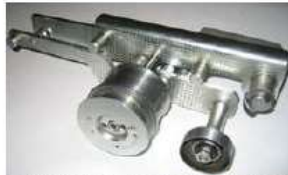
H.220.61.5 Lever f. rotorbearing cpl.