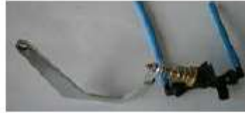
H.205.72.1 Valve cpl. f. rotorcleaning R1