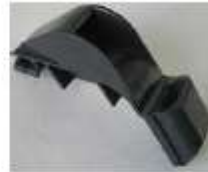
H.205.51.1 Feed funnel 3/10-8x20 cpl.