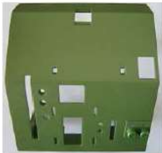
H.205.71.2 Cover R20