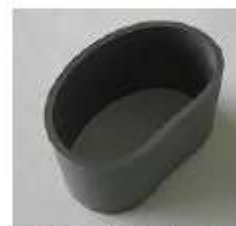
H.1300.13.1 Rubber ring