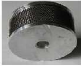
H.2000.28.1 Opening roller OB20