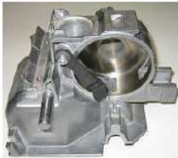
H.205.20.1 Opening roller house R1