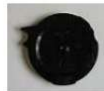
H.205.24.1 Cover R1/R20