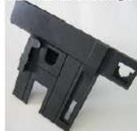
H.205.19.2 Coverage R20