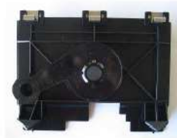
H.205.31.2 Rotor housing with metal clamp