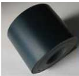
H.200.41.1 Conveyor belt 100x51.700 10S H.200.41.2 Conveyor belt 100x56.675 11S H.200.41.3 Conveyor belt 100x61.630 12S H.200.41.4 Conveyor belt 100x66.550 13S H.200.41.5 Conveyor belt 100x71.525 14S