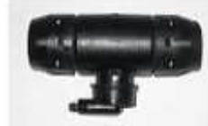
H.245.06.1 Valve FUS