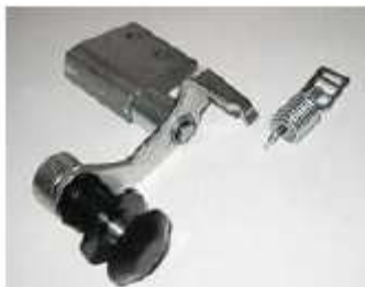
H.225.20.1 Lever f. top roller