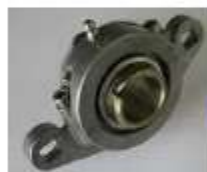
H.215.01.1 Bearing f. opening roller shaft