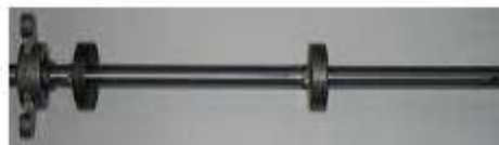
H.215.17.4 Opening roller shaft cpl.