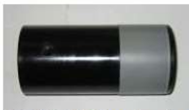
H.225.73.1 Winding roller cyl. cpl.