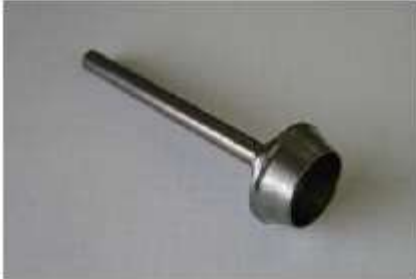
H.205.41.30 Rotor D30 mm steel