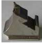
H.205.37.1 Feed plate R1