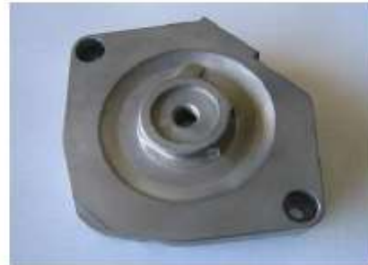
H.205.39.30.2 Face plate D30 mm R20