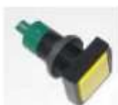
H.205.55.9 Switch element