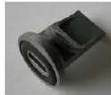
H.205.20.6 Insert f. opening roller house R1/R20