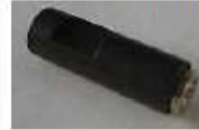
H.220.57.5 Adjusting bush