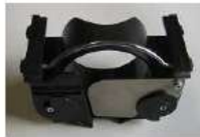
H.225.68.1 Cover f. waxing device