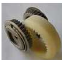
H.225.05.6 Coupling cpl.