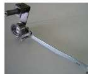
H.215.00.1 Holder + tape tension roller cpl.