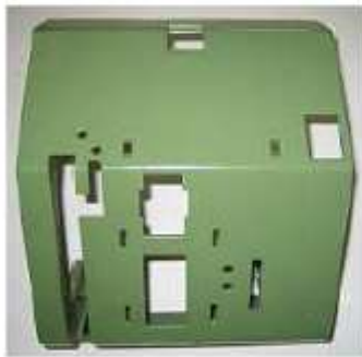
H.205.71.1 Cover R1