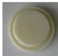
H.2700.38.1 Package plate cyl. D54