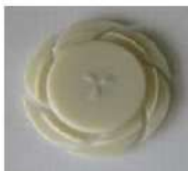
H.2700.31.1 Transfer tail plate cyl. D54