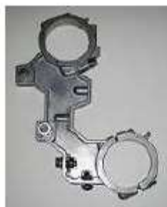
H.225.04.5 Bearing f. winding a. delivery shaft