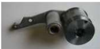
H.2501.11.1 Roller lever C