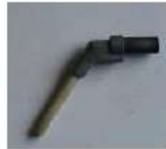
H.3300.73.1 Thread guide tube soft-twist