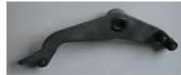
H.2501.31.1 Intern lever