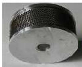
H.2000.28.1 Opening roller OB20