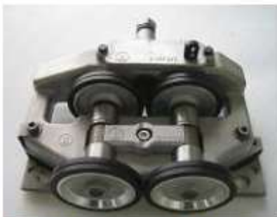
H.2500.01.1 Rotor bearing cpl. C