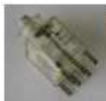
H.3300.65.1 Switch element