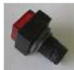
H.3300.65.4 Activity element