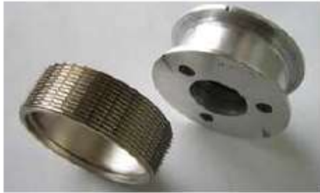
H.2000.28.5 Opening roller SOLID RING OS21-6 cpl.