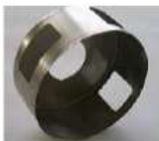
H.2300.02.4 Pot f. opening roller house 16 mm