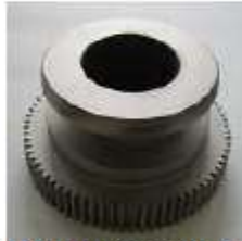
H.0600.09.1 Spur gear