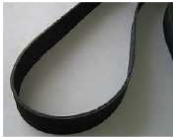
H.0200.78.4 Flat belt 25x26.485 4S