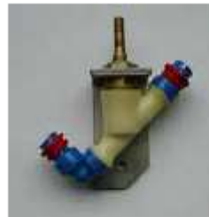
H.3300.38.5 Valve cpl. P