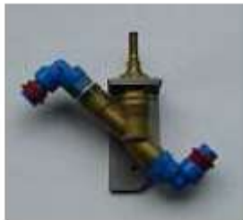
H.3300.38.1 Valve cpl. M