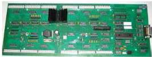
H.4100.20.1 Section board RU14-A