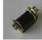
H.3300.94.1 Magnet f. thread guard