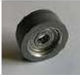
H.1300.89.2 Top roller cpl. with bearing