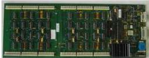
H.4100.10.1 Section board RU04/14