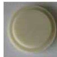
H.2700.38.1 Package plate cyl. D54