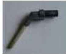
H.3300.73.1 Thread guide tube soft twist