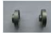
H.2300.17.1 Drive pulley steel