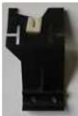
H.1300.46.4 Thread guide bottom1,3