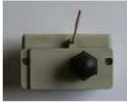
H.3300.64.1 Thread guard cpl.