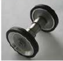
H.2500.28.1 Supporting roller w. bearing