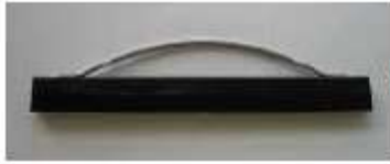
H.1300.36.1 Terminal strip