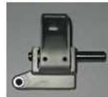
H.2000.07.6 Feeding funnel