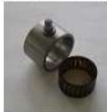
H.2301.23.2 Needle bearing