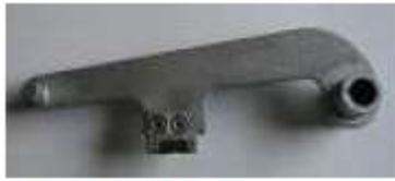
H.2500.11.1 Brake lever C