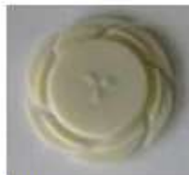
H.2700.31.1 Transfer tail plate cyl. D54