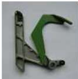
H.3300.33.1 Lever f. cleaning