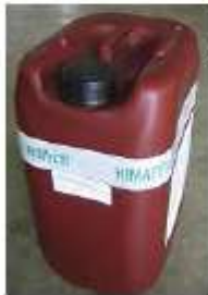
H.0201.67.1 Synt. Oil f. gearing