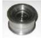
H.2300.7.1 Tension roller