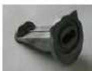
H.2000.48.4 Insert f. opening roller house