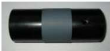
H.1300.12.1 Friction roller