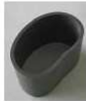
H.1300.13.1 Rubber ring