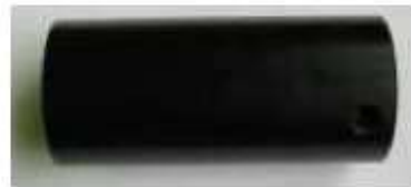
H.1300.12.2 Friction roller solid