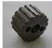
H.0300.80.1 Cogged belt