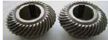
H.0201.46.1 Spiral bevel gear pair