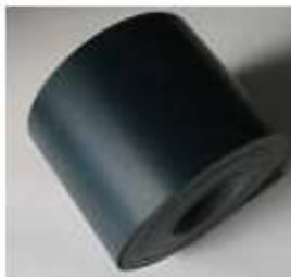
H.0800.26.4 Conveyor belt 100x24.040 4S