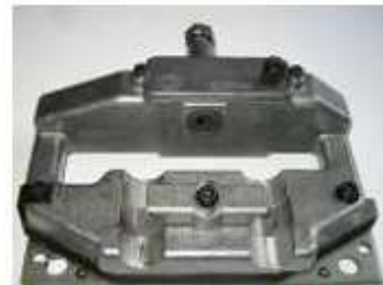
H.2500.02.1 Rotor bearing C