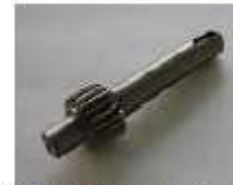
H.0600.14.1 Pinion shaft