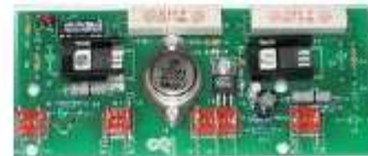
H.4500.22.1 N7 DUO - Tyrister