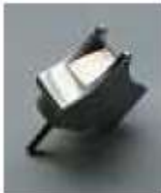
H.2000.05.1 Feeding tray fine