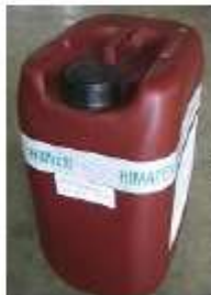
H.2500.60.1 Oil f. rotor bearing