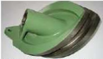
H.0600.10.1 Lifter cam