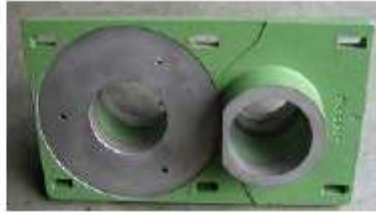
H.0310.01.1 Bearing plate