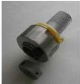
H.210.06.8 Clutch f. delivery shaft