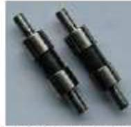
H.2501.29.1 Twin disc - bearing