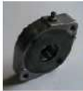
H.2300.18.1 Bearing cpl.