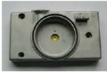
H.2600.08.2 Rotor housing