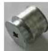
H.2501.37.1 Castor cpl. C