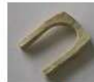
H.2500.26.1 Lubrication wick