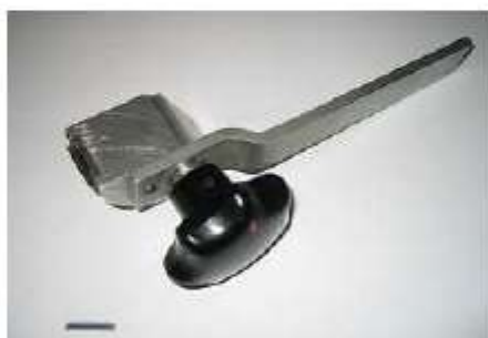
H.2000.28.9 Tool f. opening roller house clip