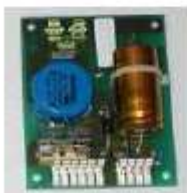
H.4500.08.1 Power filter