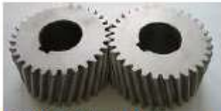
H.0200.08.1 Helical spur gear pair