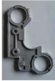
H.1300.05.1 Bearing friction a. delivery