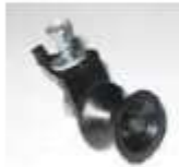
H.1300.42.4 Roller bearing