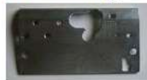
H.3300.03.1 Fitting plate