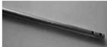
H.1300.22.4 Thread guide rod top