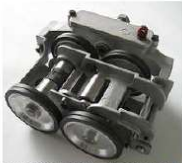
H.2500.01.5 Rotor bearing cpl.