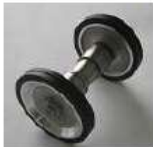
H.2500.28.5 Supporting roller w. bearing