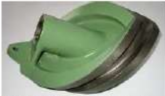
H.0600.10.1 Lifter cam