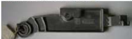
H.2700.09.3 Swivel arm R