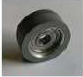
H.1300.89.2 Top roller cpl. with bearing