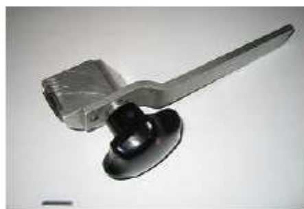
H.2000.28.9 Tool f. opening roller house clip