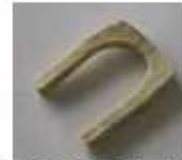
H.2500.26.1 Lubrication wick