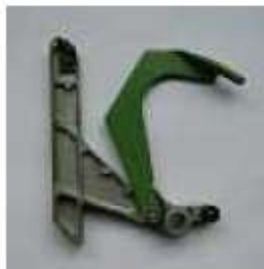
H.3300.33.5 Lever f. cleaning