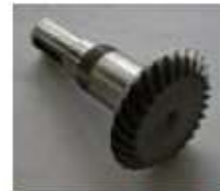
H.0200.43.1 Spiral bevel gear