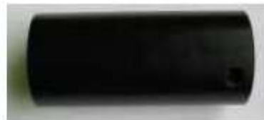
H.1300.12.2 Friction roller solid