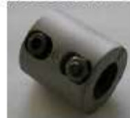
H.2700.25.3 Package holder cpl.