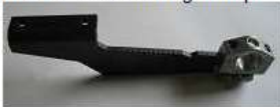
H.2300.23.1 Bearing f. feeding cyl.