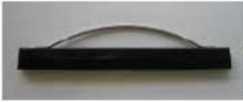
H.1300.36.4 Terminal strip