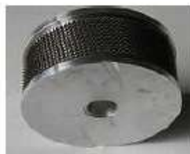
H.2000.28.1 Opening roller OB20