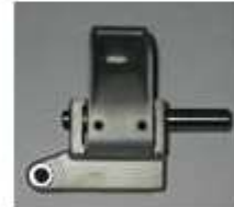
H.2000.07.6 Feeding funnel