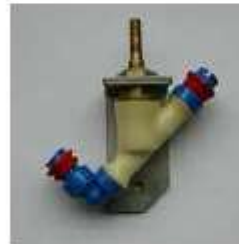
H.3300.38.5 Valve cpl. P