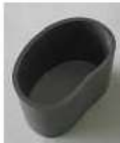
H.1300.13.1 Rubber ring