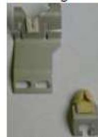
H.1300.24.8 Thread guide m 1,3