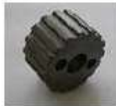
H.0300.80.1 Cogged belt gear