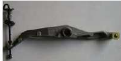
H.2000.16.1 Brake lever