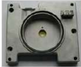
H.2600.08.5 Rotor housing