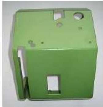
H.3300.02.5 Cover RU11