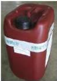
H.0201.67.1 Synt. Oil f. gearing