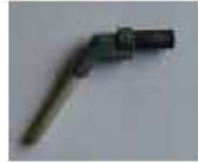
H.3300.73.1 Thread guide tube soft twist