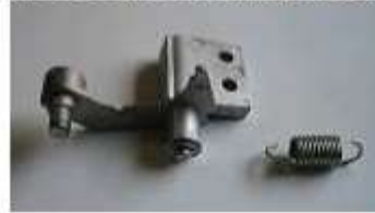
H.1300.19.3 Auxiliary suction