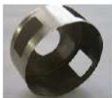
H.2300.02.7 Pot f. opening roller house 16 mm