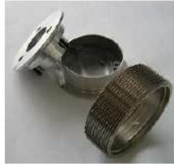
H.2000.28.5 Opening roller SOLID RING OS21-6 cpl.