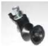
H.1300.42.4 Roller bearing