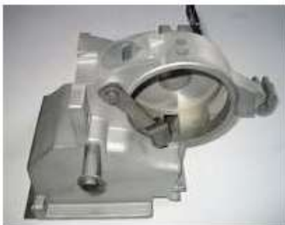
H.2300.02.6 Housing f opening unit