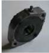
H.2300.18.1 Bearing cpl.