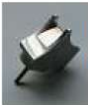
H.2000.05.1 Feeding tray fine