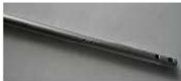
H.1300.22.6 Thread guide rod top RU11