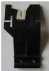
H.1300.46.4 Thread guide bottom 1,3