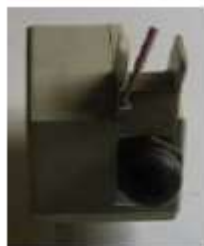
H.2200.17.1 Thread guard cpl.