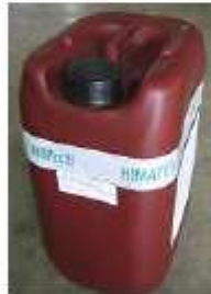
H.2500.60.1 Oil f. rotor bearing