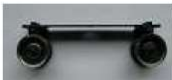
H.2500.31.1 Tension roller