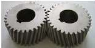
H.0200.08.1 Helical spur gear pair