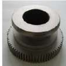
H.0600.09.1 Spur gear