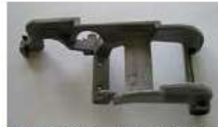
H.2500.11.1 Roller lever