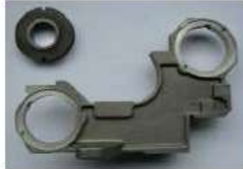
H.1300.05.4 Bearing friction a. delivery