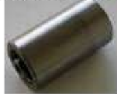
H.2500.04.5 Setting screw