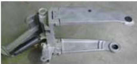
H.2700.25.3 Friction absorber