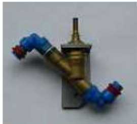
H.3300.38.1 Valve cpl. M