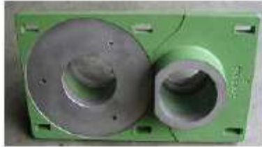
H.0310.01.1 Bearing plate