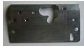
H.3300.03.5 Fitting plate