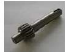
H.0600.14.1 Pinion shaft