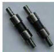
H.2500.29.5 Twin disc - bearing