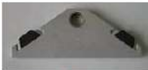
H.2500.21.1 Brake cpl.