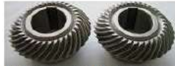
H.0201.46.1 Spiral bevel gear pair