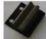
H.2500.18.1 Brake spring cpl.