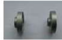
H.2300.17.1 Drive pulley steel