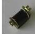
H.3300.94.5 Magnet f. thread guard