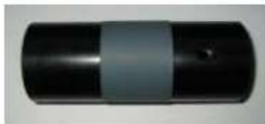
H.1300.12.1 Friction roller