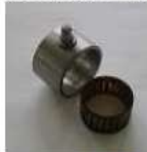
H.2301.23.2 Needle bearing